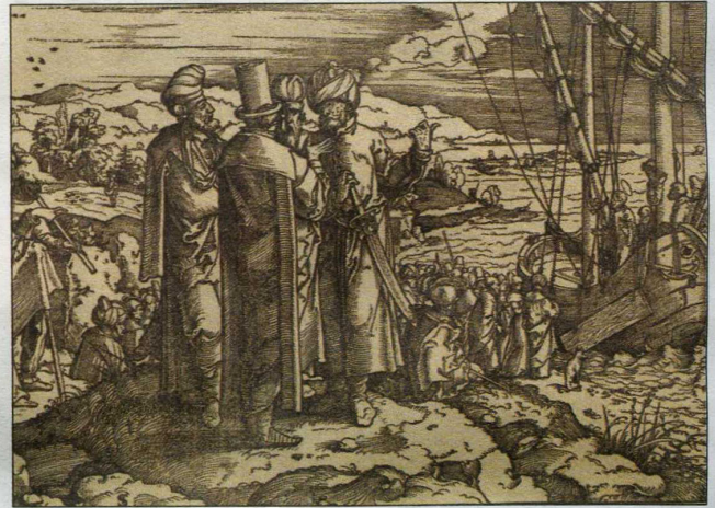
Jan Swart, "Jesus Preaching from the Ship," 1525.