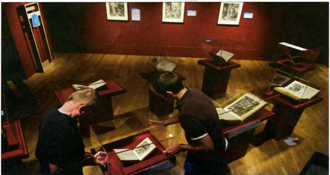
Carlos Museum staff make final adjustments to the "Scripture for the Eyes" exhibit before its Oct. 17 opening.