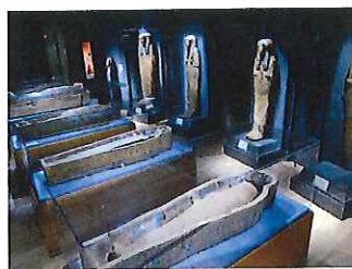
MICHAEL C. CARLOS MUSEUM