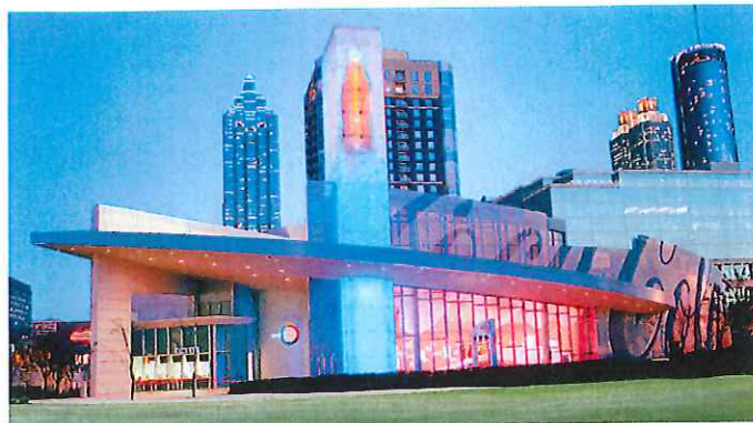
WORLD OF COCA-COLA