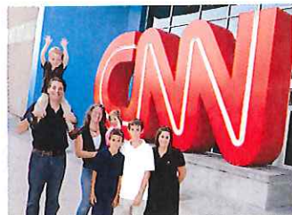
INSIDE CNN STUDIO TOUR