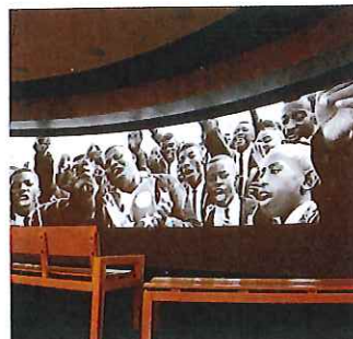
CENTER FOR CIVIL AND HUMAN RIGHTS