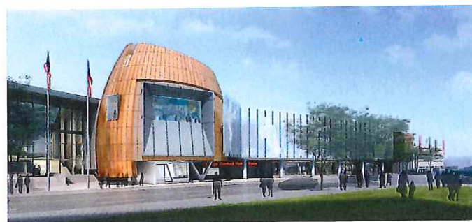
COLLEGE FOOTBALL HALL OF FAME AND CHICK-FIL-A FAN EXPERIENCE