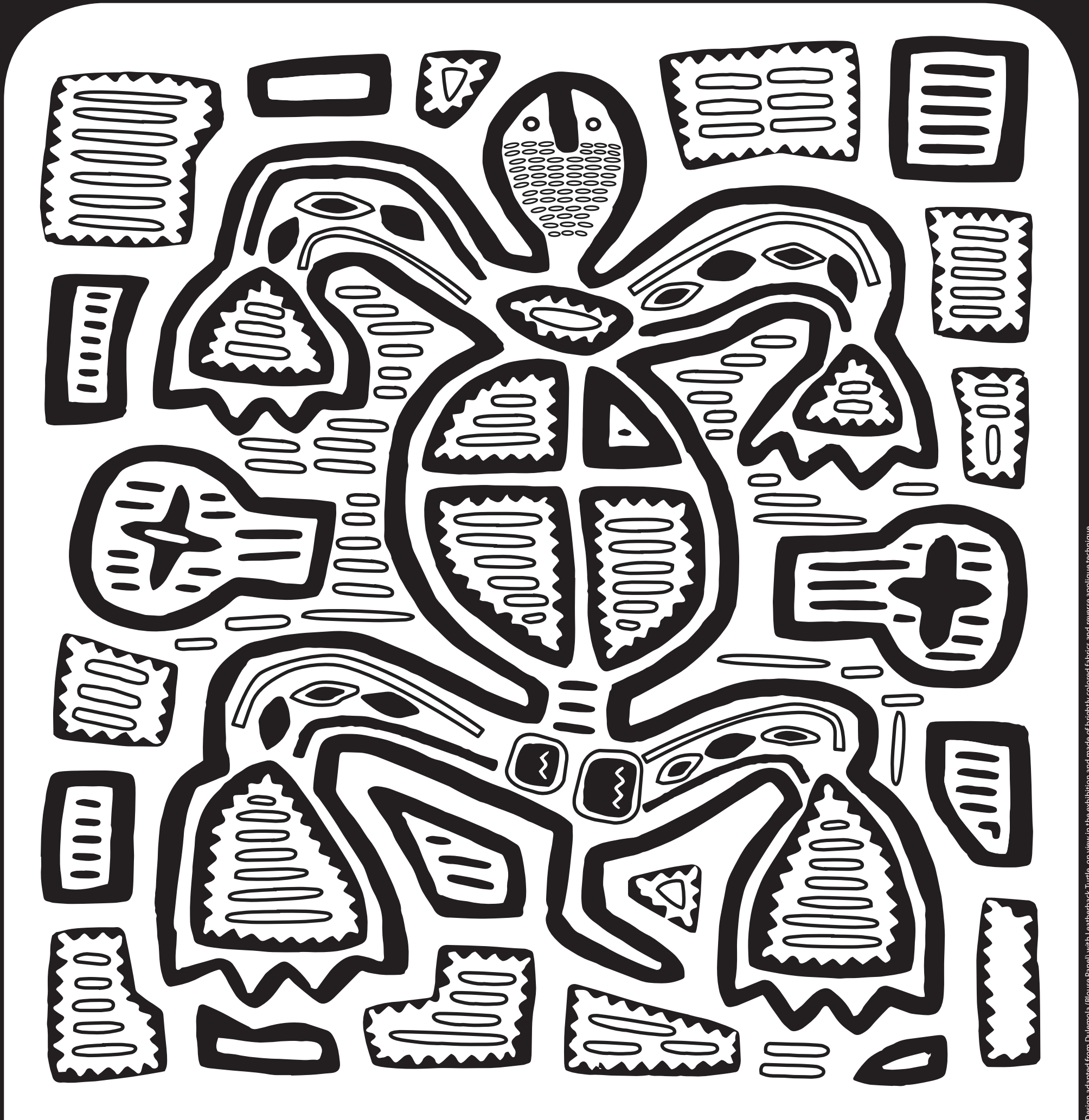
Design adapted from Dulemola (Blouse Panel) with Leatherback Turtle, on view in the exhibition and made of brightly colored fabrics and reverse applique technique.

Visit Atlanta's Michael C. Carlos Museum, where the stories of civilization come alive!