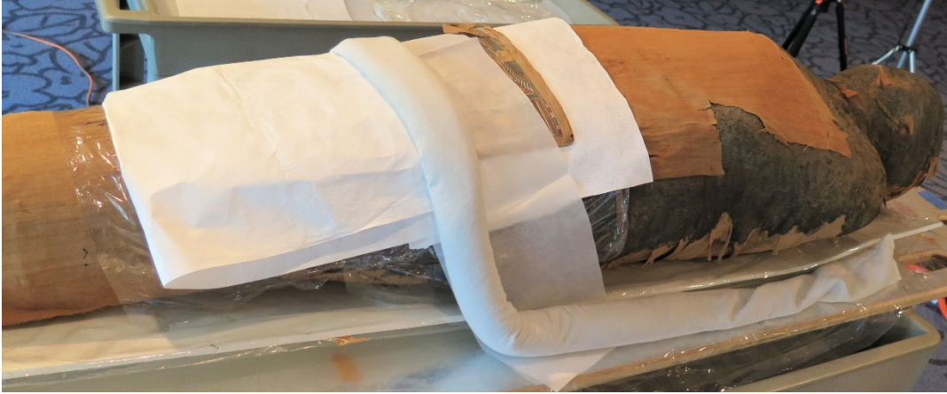
Humidifying the abdominal panel

Because these panels are so thin and they have a red paint that can be easily over-humidified and become sticky, it is important to go as slowly as possible. I created miniature humidity chambers over the panels- doing them one at a time, gradually adding gentle weight and tending them frequently.