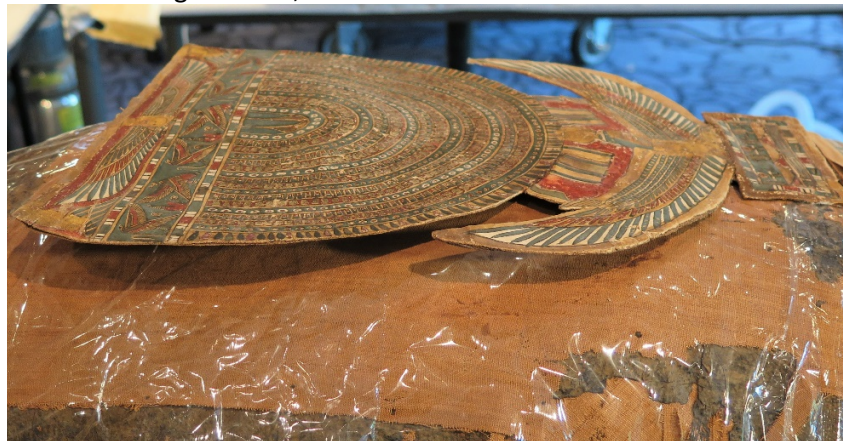
The pectoral panel before humidification

Once the fills were set, it was possible to start to reshape the panels to fit on the mummy, as you can see in the images below, it was far from a close fit to start with.