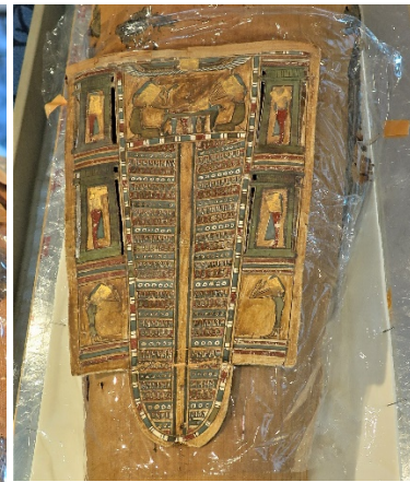
the abdominal panel