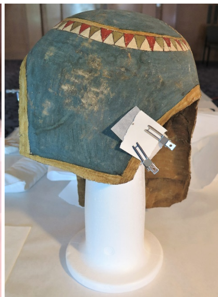
The partly reshaped mask