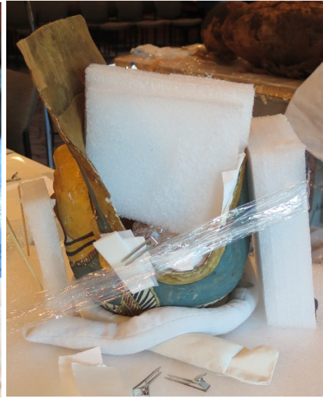
reshaping upside down

Look for the next mummy diary tomorrow (or watch us on the mummy cam) to see how successful that treatment was!