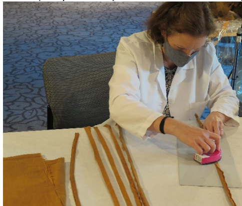
Ironing the modern linen bands

The next thing we needed to check was the mask - we removed the padding that was opening out the mask and discovered that it now fit on the wig stand so we can proceed to open it out with better support.