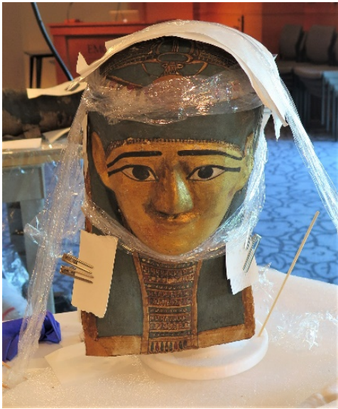
Humidifying on the wig stand

The mask was humidified on the wig stand for several hours, then taken off the wig stand and turned over to increase the pressure on the distorted sections and humidified for the rest of the day.