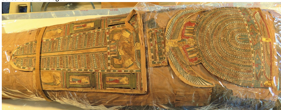
The reshaped panels fitted to the mummy with a mockup linen band.

The first thing to do this morning was to check on the two cartonnage panels that were reshaped to fit back on the body- we were delighted at how well it had worked and that none of the paint became softened or smudged.