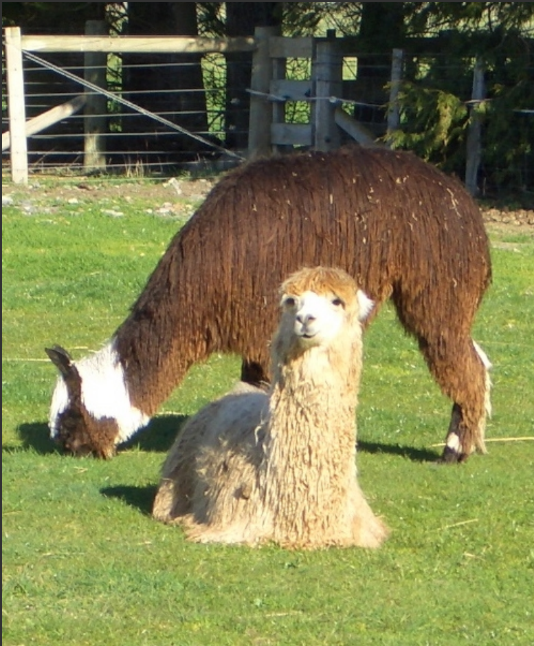
Wool from Alpaca