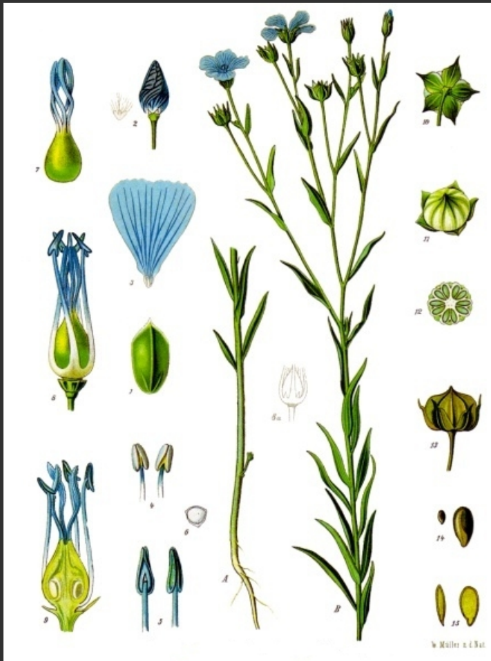
Linen from Flax