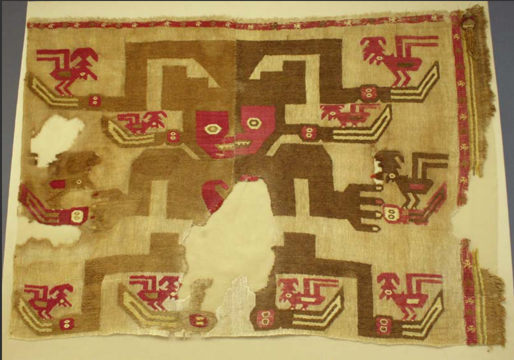
Textile Fragment with Pelican Shaman Chimu, Peru 1100-1470 MCCM 2002.8.1

The tan background cloth for this brocaded textile was woven from cotton threads. The colored image threads are dyed wool.