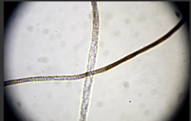
Wool – see scales