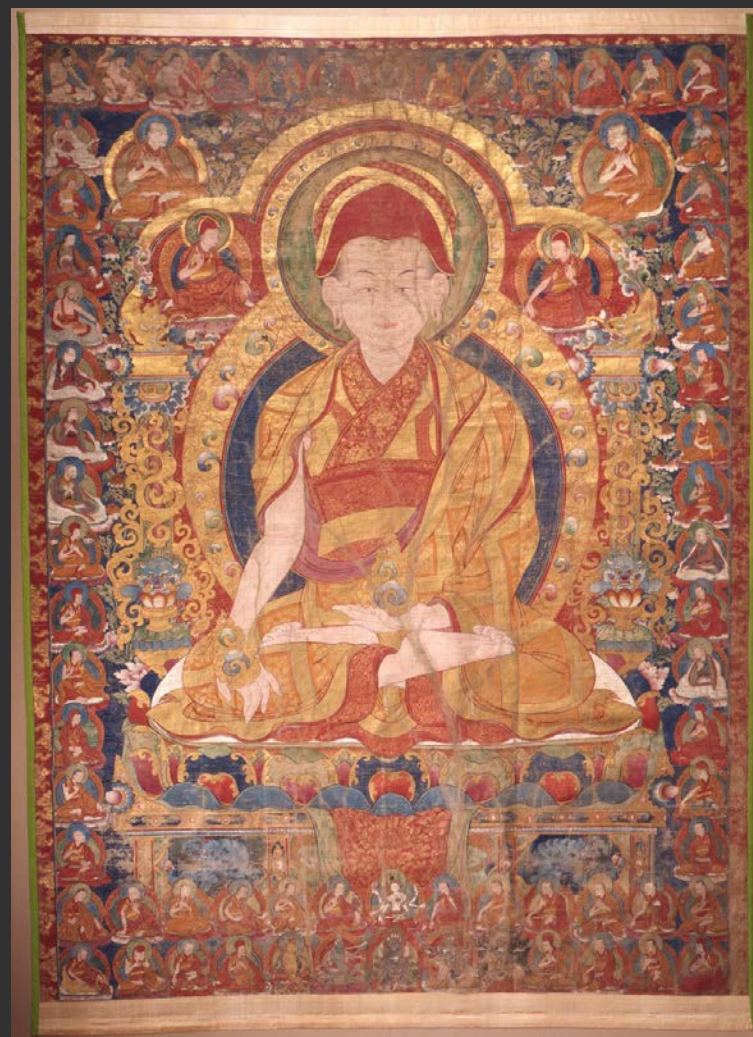
Patriarch of Ngor Monastery Tibetan, 17 th century MCCM 2000.5.5