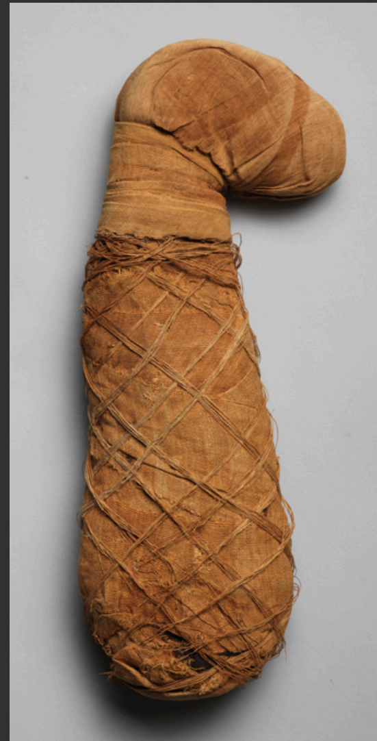
Dog Mummy Egyptian, 664-332 BC MCCM 2011.3.1