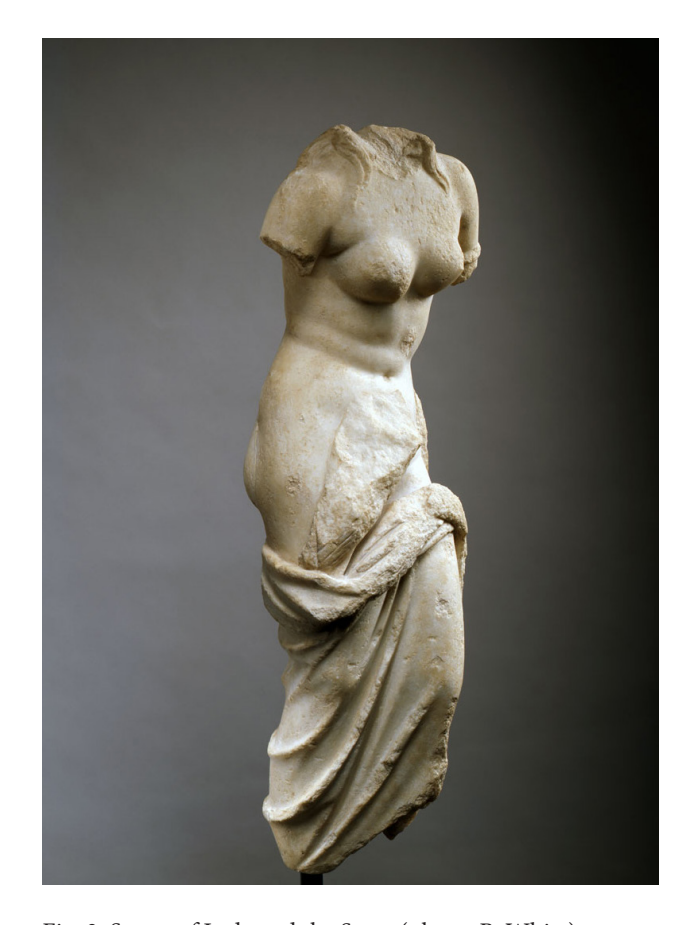
Fig. 3. Statue of Leda and the Swan