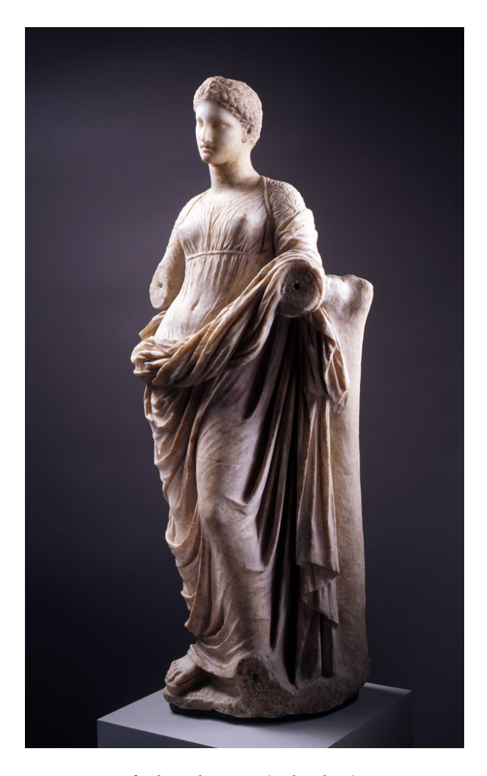
Fig. 1. Statue of a draped woman (Aphrodite?)

Following visual assessment of marble color, patterning, translucency, and maximum grain size (MGS), powder samples were drilled from each sculpture. In cases of sculptures assembled from different elements,