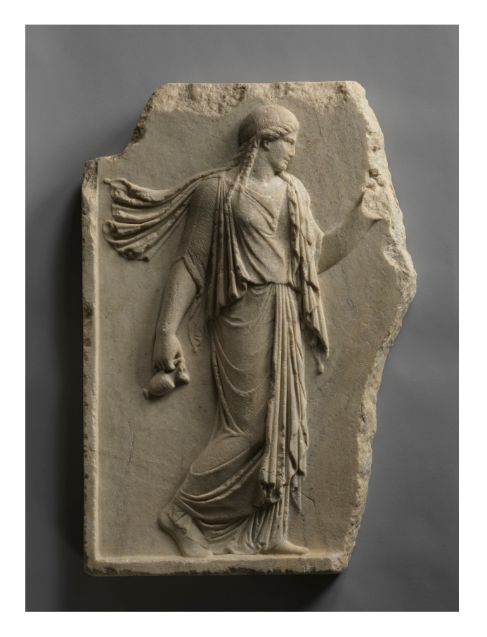
Fig. 2. Relief of a draped woman