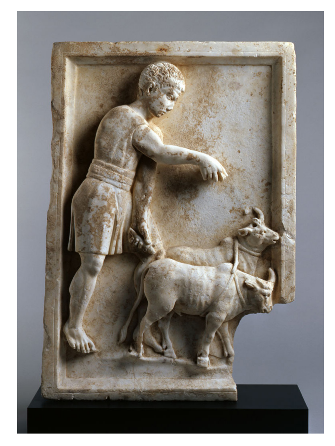
Fig. 5. Relief of a ploughman